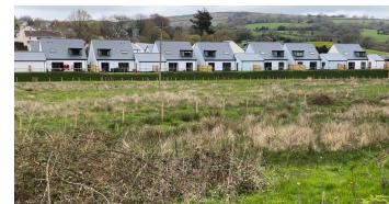
MDT's community wetland