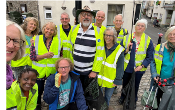
Community litter pick after Carnival